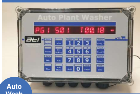
Auto Wash Pro