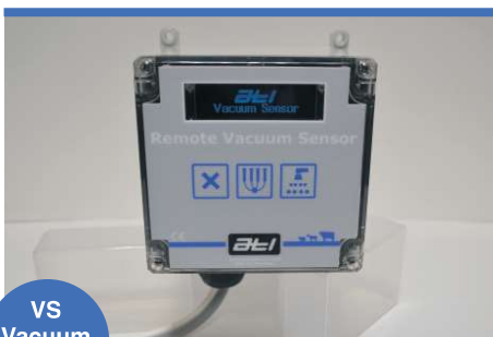
VS Vacuum Control