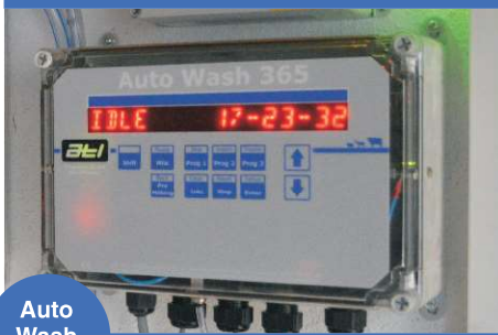
Auto Wash 365

Modular ATL technology supports a range of options to suit individual demands, needs and requirements