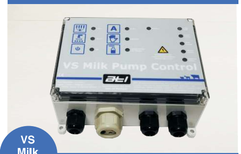
VS Milk Control